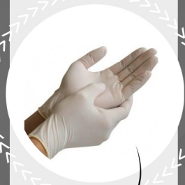
Disposable sterile gloves