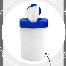
Alcohol free cleaning wipes