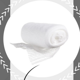
Large and medium bandages and gauze dressings