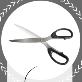
Scissors and Tweezers