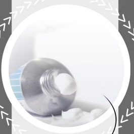
A variety of ointments: Insect bites Antiseptic Burn remedies Skin rashes